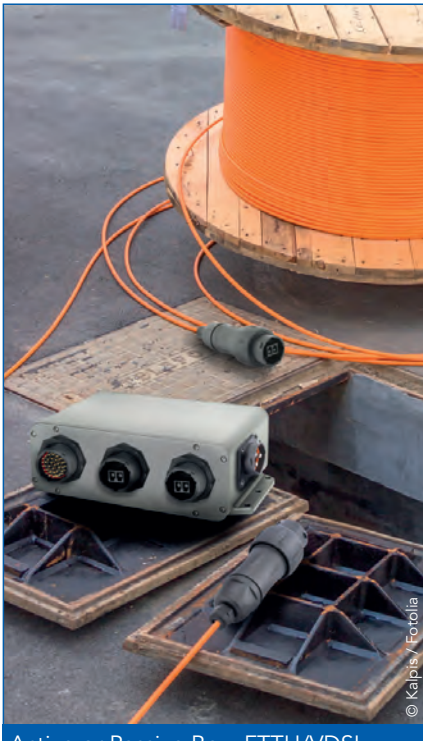
Active or Passive Box: FTTH/VDSL