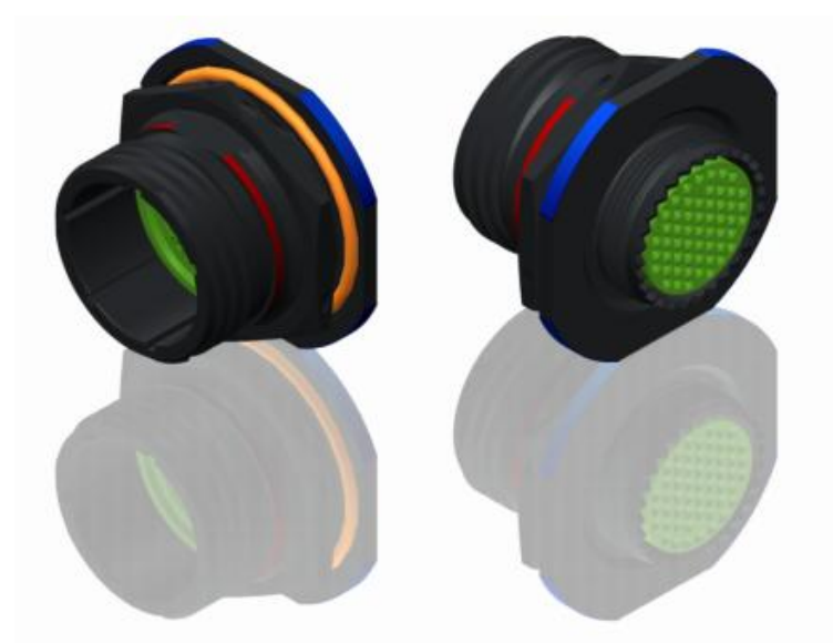
LAYOUT SHOWN AS EXAMPLE