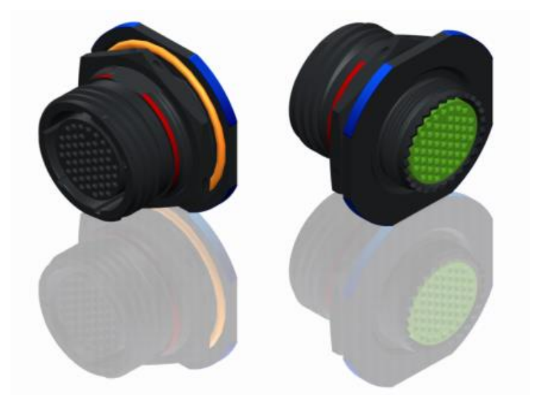
LAYOUT SHOWN AS EXAMPLE